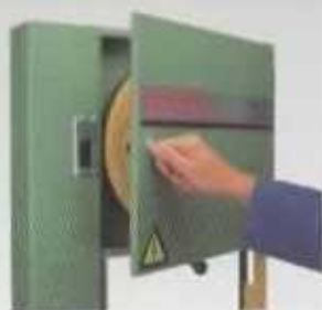
Lockable/interlocked bandwheel doors