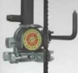
Roller guide system (502S)