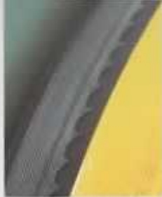
Dynamically balanced/ground rubber tyred bandwheels

Safety has been a prime consideration. Among the host of features offered are lockable bandwheel doors, fully guarded blade, door safety interlocks, rapid stopping, lockable electrical isolators, low voltage protection thermal overload and dust extraction coupling.